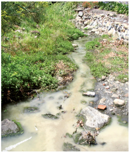
Sediment entering the stormwater system leads to turbid and unhealthy waterways