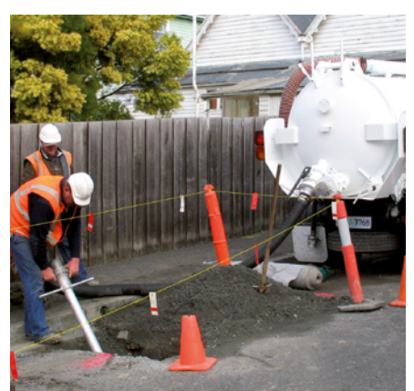
Where possible a licensed liquid waste tanker should be used to pump out accumulated stormwater.