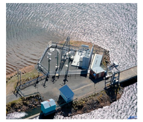
Arthurs Lake Substation