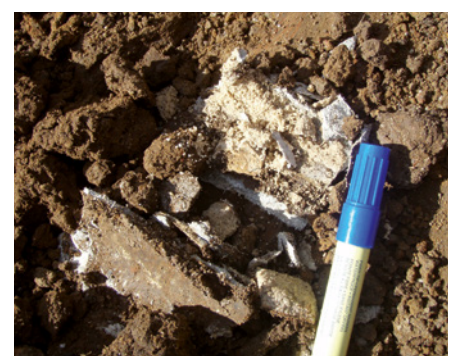
Work should immediately cease if broken asbestos is uncovered