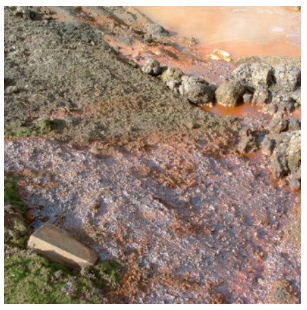
ASS can be identified by rust coloured surface soil.