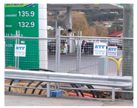
Care should be taken to look out for contaminated soil when working around high risk areas such as service stations