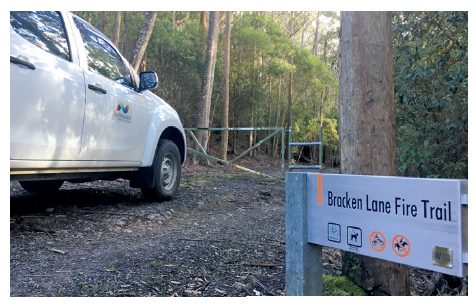
kunanyi/Mount Wellington Park Reserve