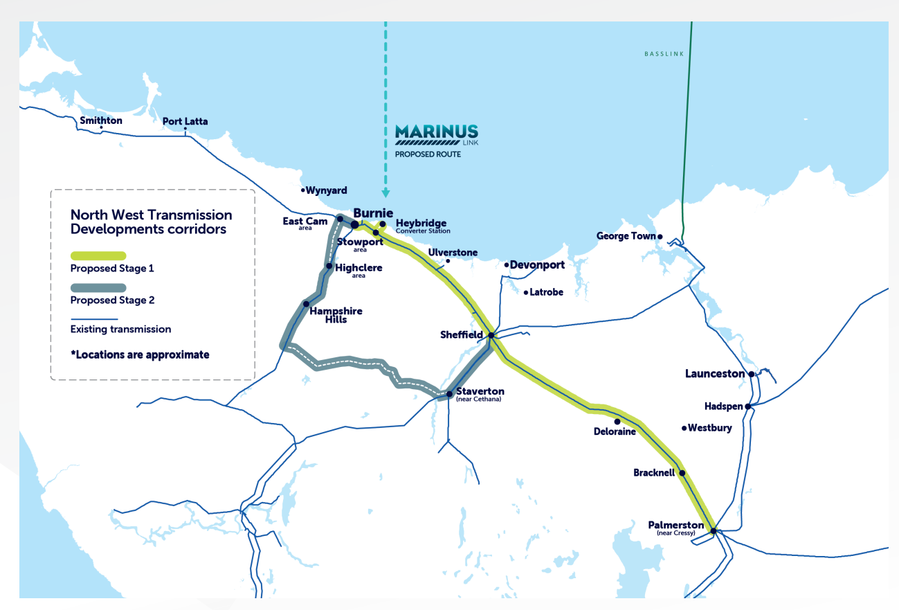
Figure 1: The NWTD project will be delivered in two stages