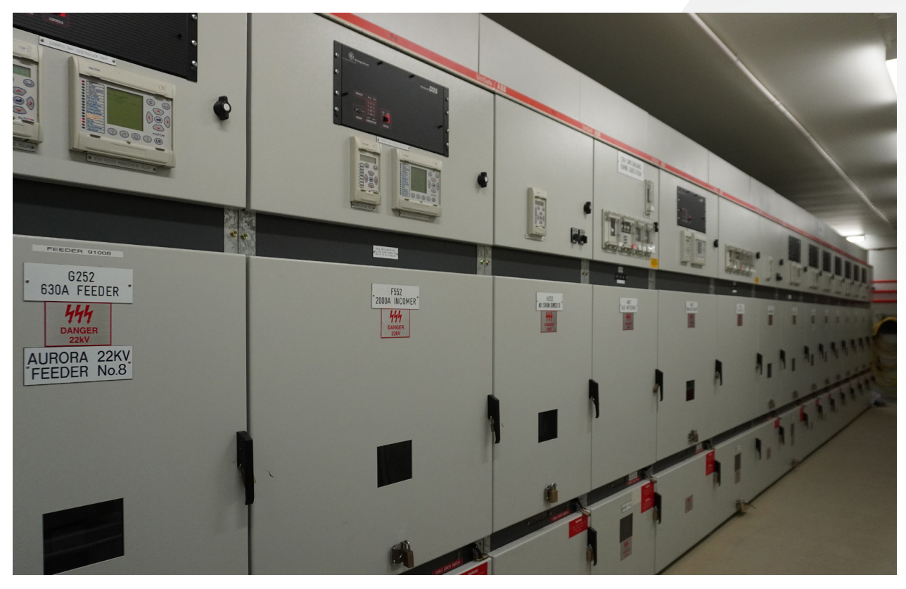
Pictured: Medium voltage distribution equipment

Medium voltage distribution equipment , also referred to as High Voltage Switchboards, are used to connect and distribute power across multiple circuits, using measuring devices and switchgear.