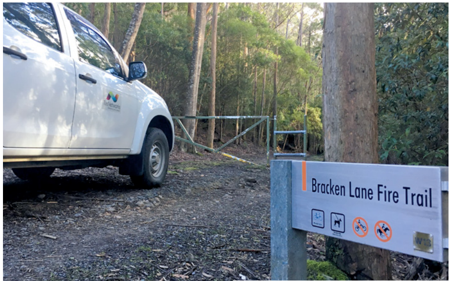
kunanyi/Mount Wellington Park Reserve